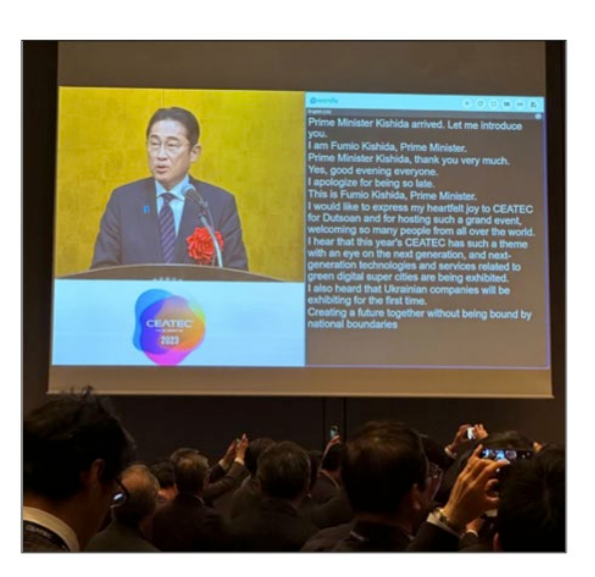
Prime Minister Fumio Kishida CEATEC 2023 | Japan